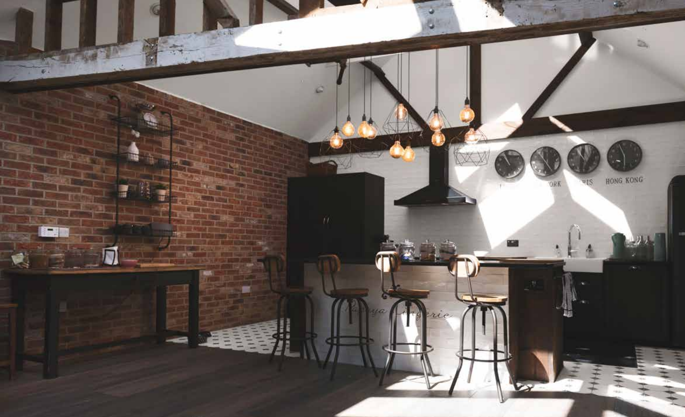
STUNNING COW SHED CONVERSION with high specification fittings, offering light & spacious contemporary offices with views across Dunsborough Park, just 30 minutes from London.